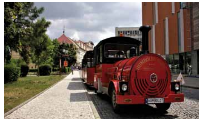
The tourist train „Humboldt“ goes through the historic centre from May to October.