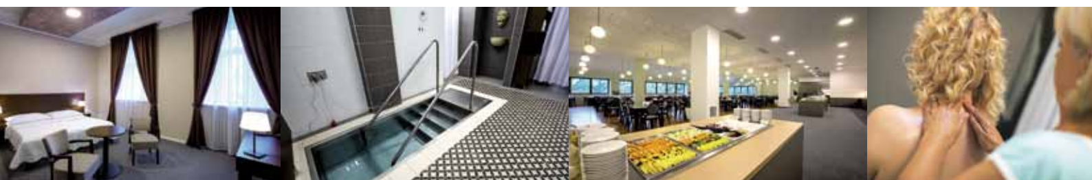
IMPERIAL SPA ***