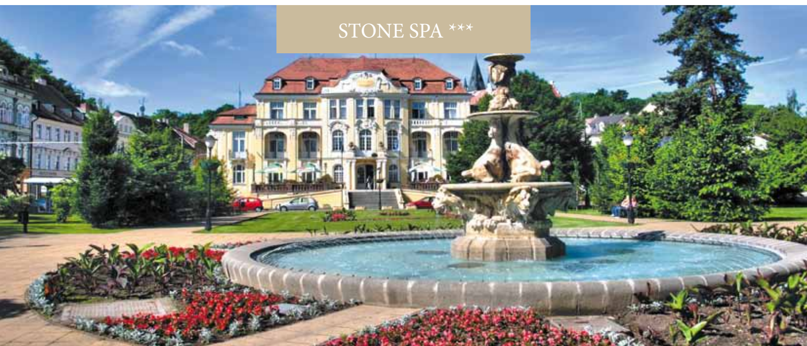
STONE SPA ***