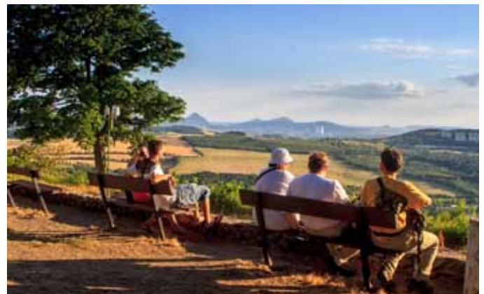
The views from Doubravka (extinct volcano) around the surroundings are breathtaking. Remains of a medieval castle can be seen at the top.