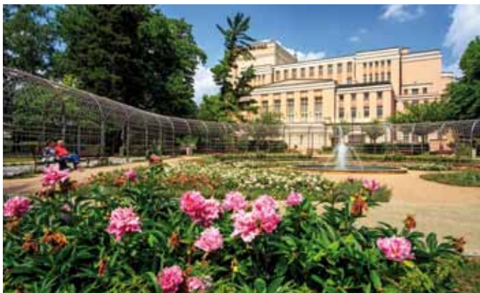
You can enjoy also the theatre (Krušnohorské divadlo) or visit the culture centre (Dům kultury) next door. www.dkteplice.cz