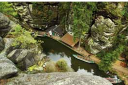
Boat ride through the gorges in Hřensko. 50 km from Teplice.