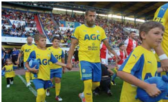
Lovers of the most popular world sport appreciate Teplice football matches. www.fkteplice.cz