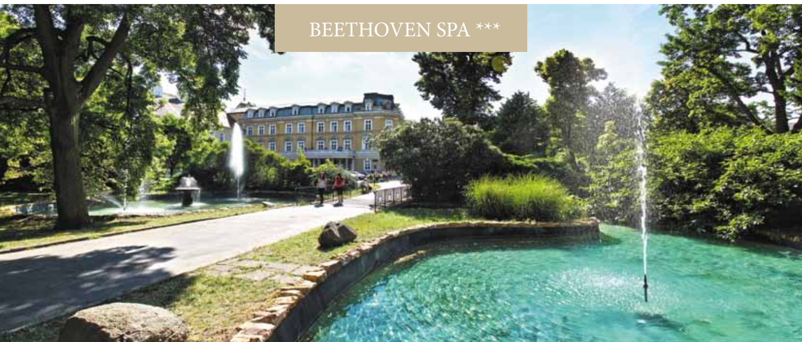
BEETHOVEN SPA ***