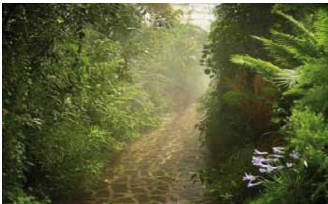
People who like admiring the nature can enjoy a tour into the Botanic Garden Teplice. www.botanickateplice.cz