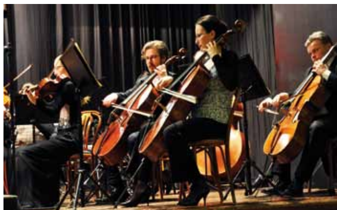
Regular concerts of the North Czech Philharmonic Orchestra take place in Culture House (see the program on www.severoceska-filharmonie.cz ).