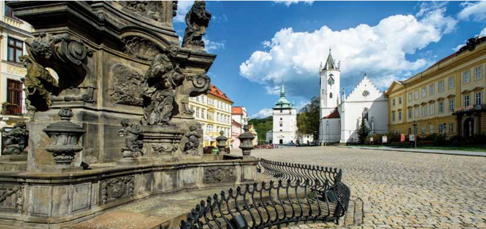
Teplice is definitely worth exploring in all aspects, starting from the Empire style architecture, through the historically preserved Zámecké náměstí (Chateau Square), up to the large Zámecká zahrada (Chateau Garden). www.muzeum-teplice.cz