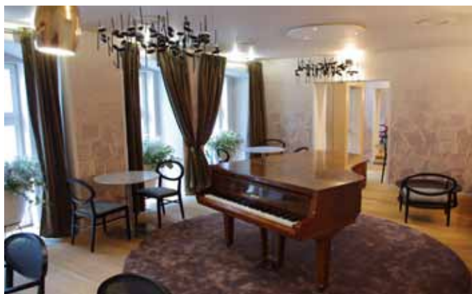
Café Restaurant Beethoven. Original spa beer, popular Spa coffee and splendid cuisine. www.beethovencafe.cz