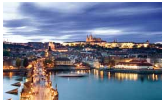
Prague - the capital and the most visited place in the Czech Republic. 90 km from Teplice.