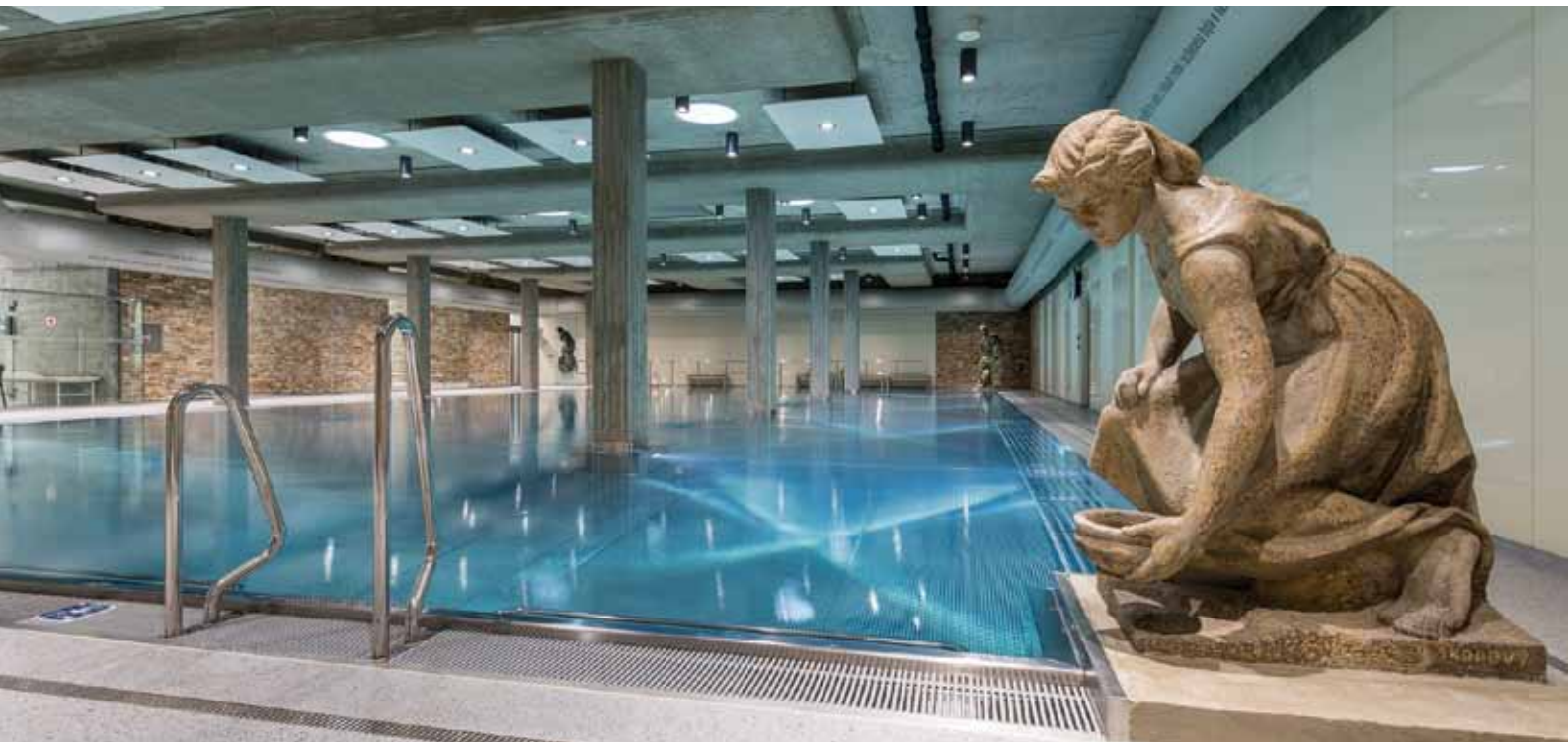
THERMALIUM - DON'T SWIM, RELAX. Unique complex of purely thermal mineral pools and saunas.