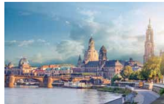
Dresden - „Pearl on the Elbe“, capital of Saxony. 80 km from Teplice.