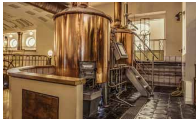
„Monopol“ brewery, in the former variety „ZUM SCHWAN“ from 1850. www.pivovarmonopol.cz